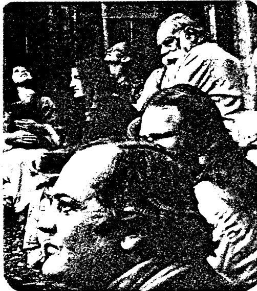
Sunday Meeting with Love Family in Murphy Park

God grant me SERENITY to accept the things I cannot change, COURAGE to change the things I can, and WISDOM to know the Difference.