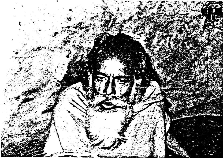
( Father - Mud Hut, Gorkara, 3rd year Siva Kalpa )